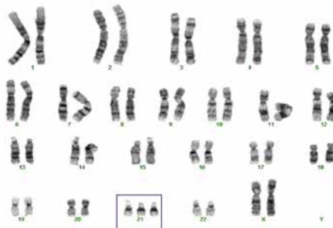
Trisomy 21: 47,XX,+21

If the midwife or obstetrician suspects any other chromosomal changes in your baby, they will talk to you about those conditions.