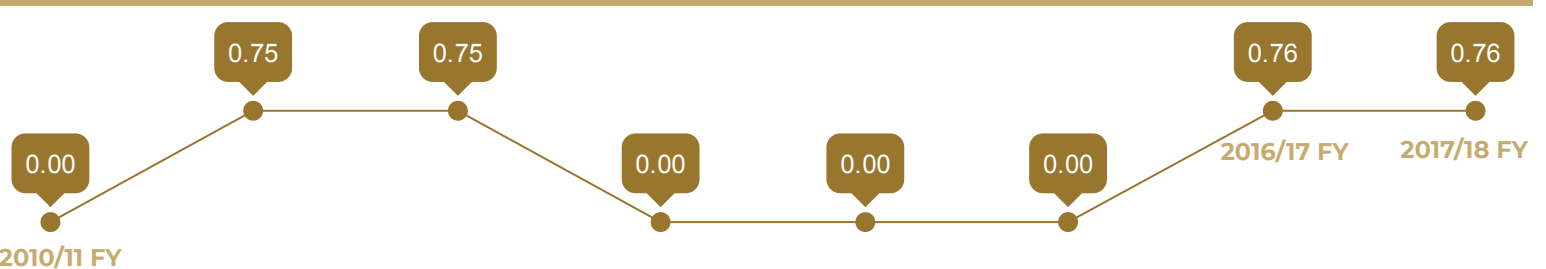
Rate per 100,000 population by FY